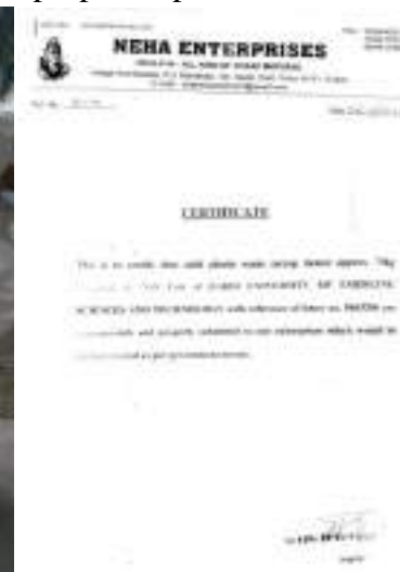
Collected Plastic waste