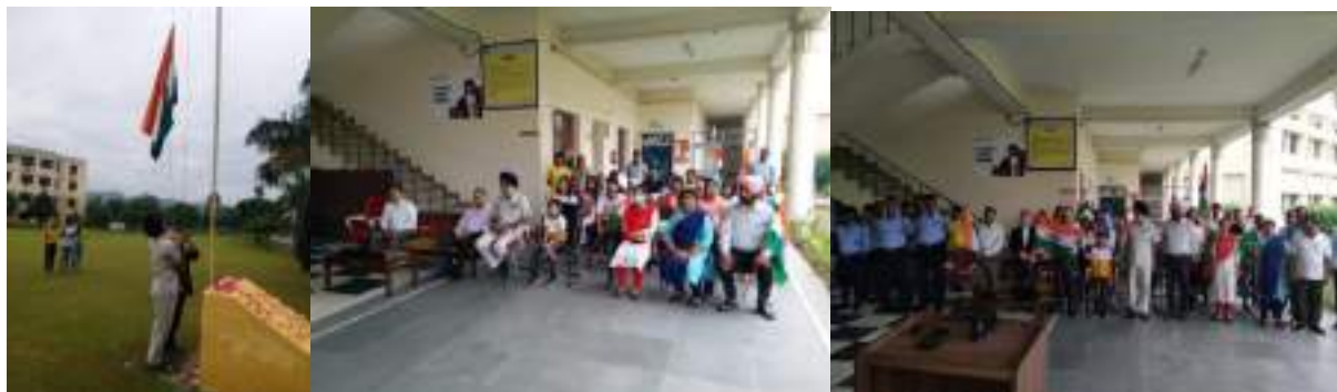
Independence Day Celebrations.