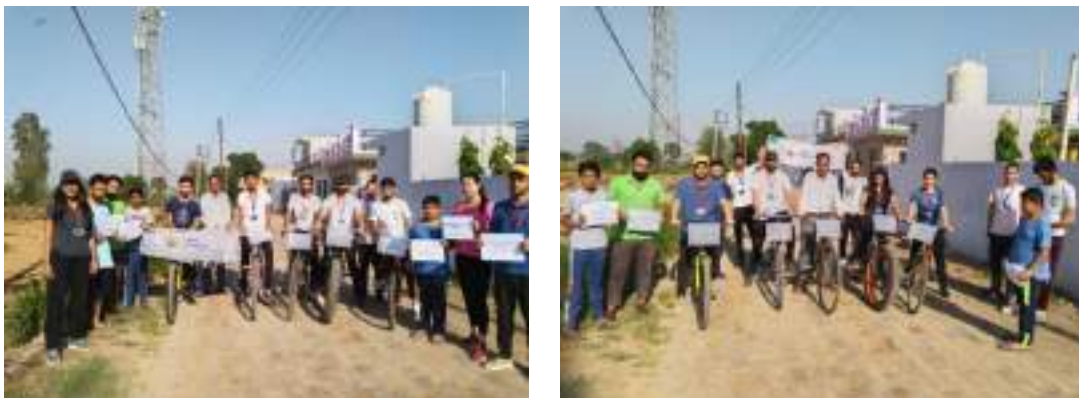
Cycle day rally in village Makhnumajra.

The NSS unit of Baddi University on 3 June, 2022 organized a cycle rally to celebrate “World Bicycle Day”. The aim of the program was to encourage and motivate people to take up and adopt cycling in their daily lives for physical fitness activities. The rally was started at 6:30 am in the morning. Many Students participated in the event. All participants were filled with enthusiasm. NSS program officer Ankita Thakur, faculty members from various departments also participated in the rally.