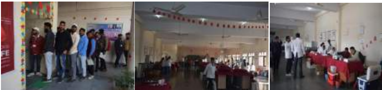
Volunteers in front of venue. View inside the venue.