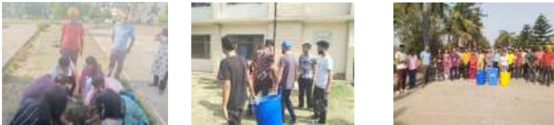
Plantation and campus cleaning drive.