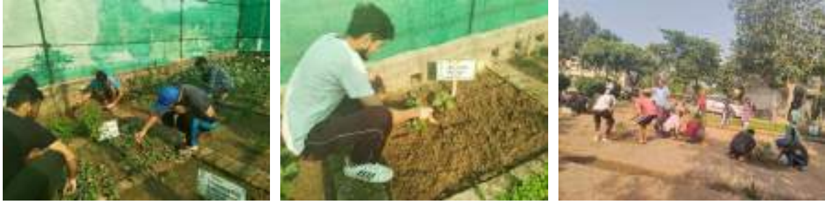
Hoing and weeding inside and outside of shade net house.