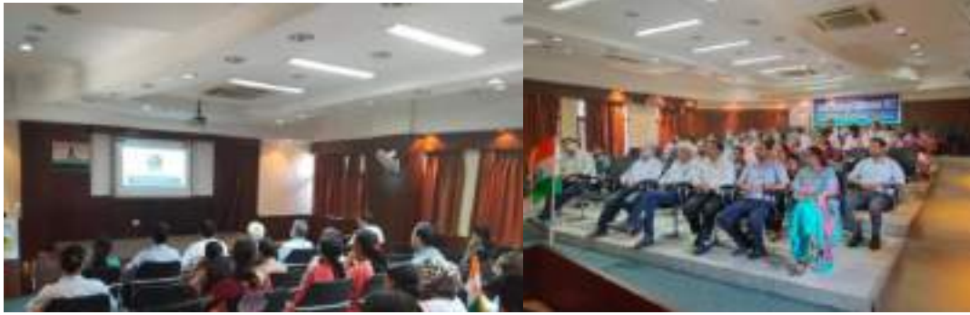
Dignitaries, NSS Coordinators and volunteers watching Documentary show