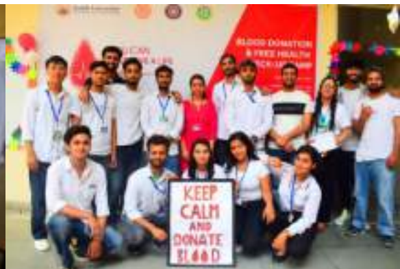
Volunteers of Blood donation camp.