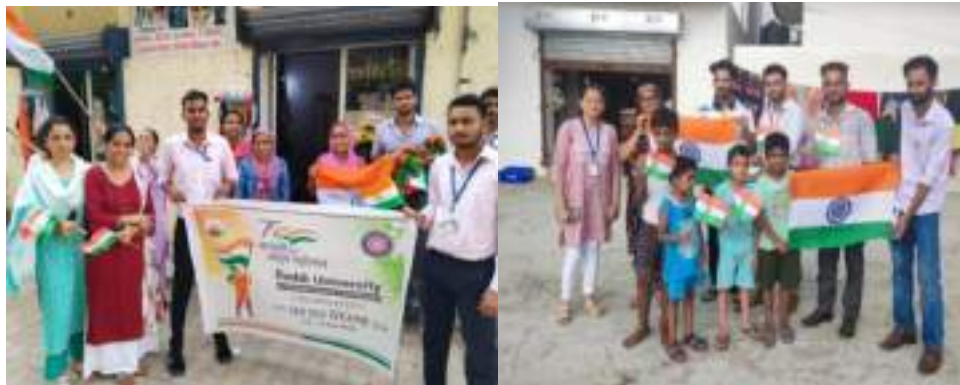
Distribution of flags at village Makhnumajra