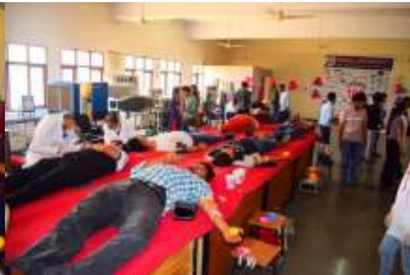
Volunteers donating blood during camp.