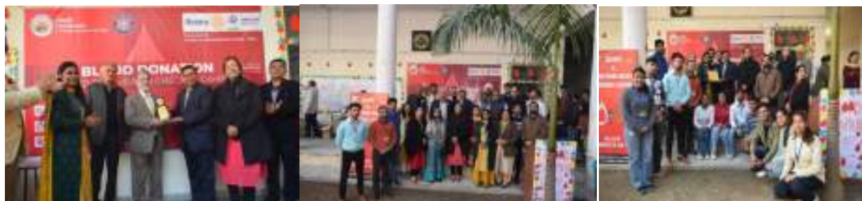
Felicitations at the end of the event.