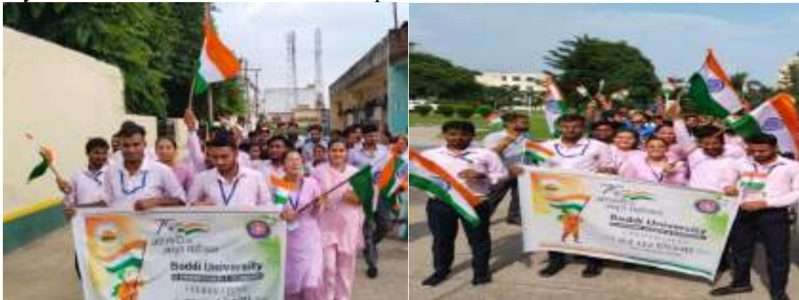
Rally by volunteers in village Makhnumajra and inside the University campus

In commemoration of the freedom we have today, the HarGharTiranga campaign has been initiated. The NSS volunteers of Baddi University took out a rally as a TirangaYatra for enlightening the people about HarGharTiranga Campaign. The aim for this time is not just hoisting the flag or reciting the National Anthem, it is about looking up at the Tricolor as it rises up in the sky. Here's what volunteers have lined up for the celebrations: