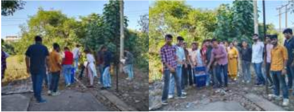
Volunteers taking part in campus cleaning drive