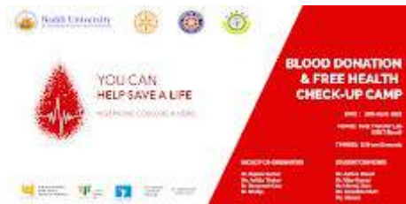
blood donation camp flex.png 5156K