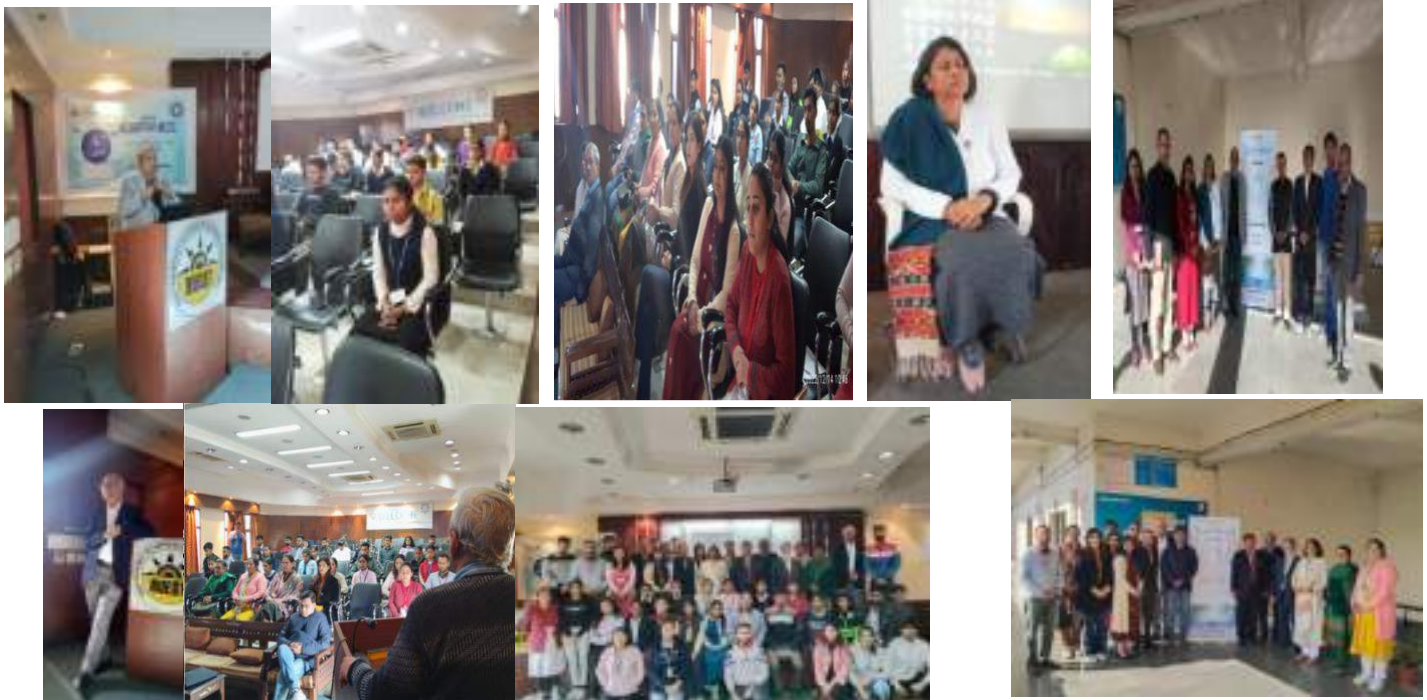
Glimpses of the 3 Day Meditation Workshop