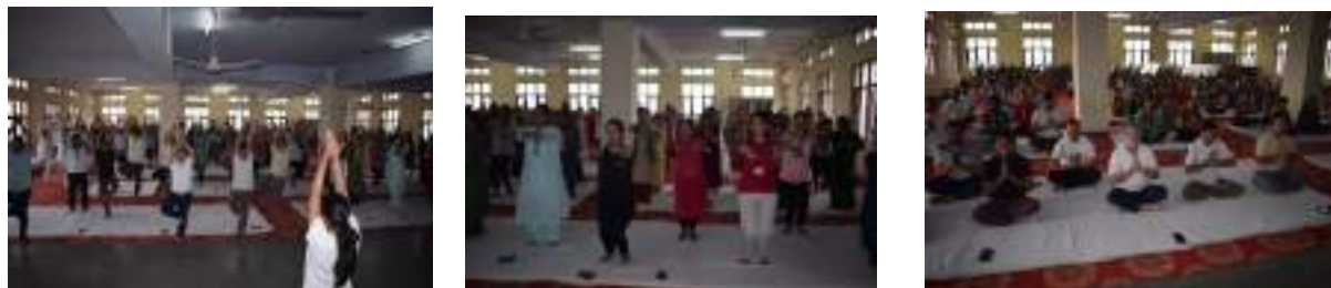
Asanas performed by students and staff members of Baddi University