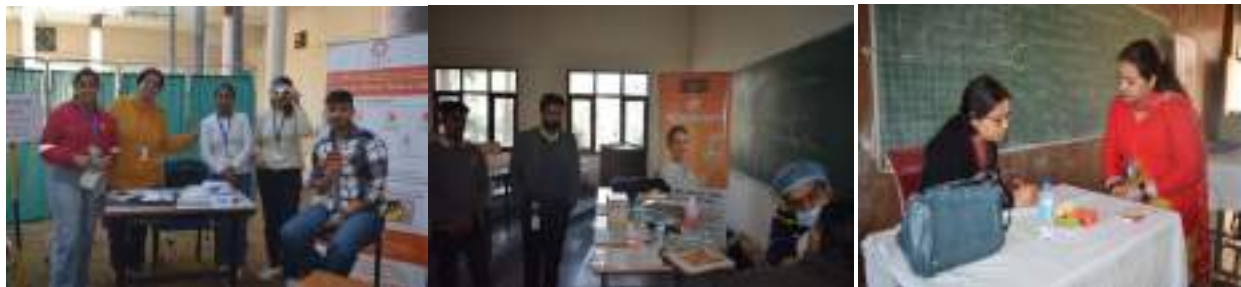
Doctors attending patients