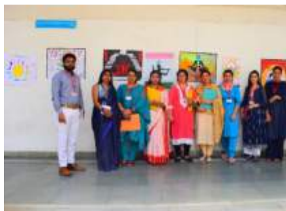
Faculty member judging charts