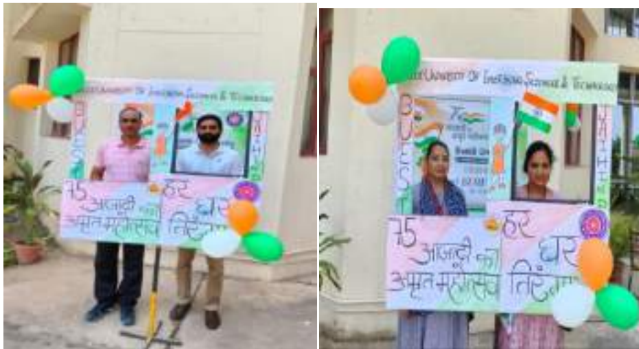
Staff of BUEST taking pictures at selfie point